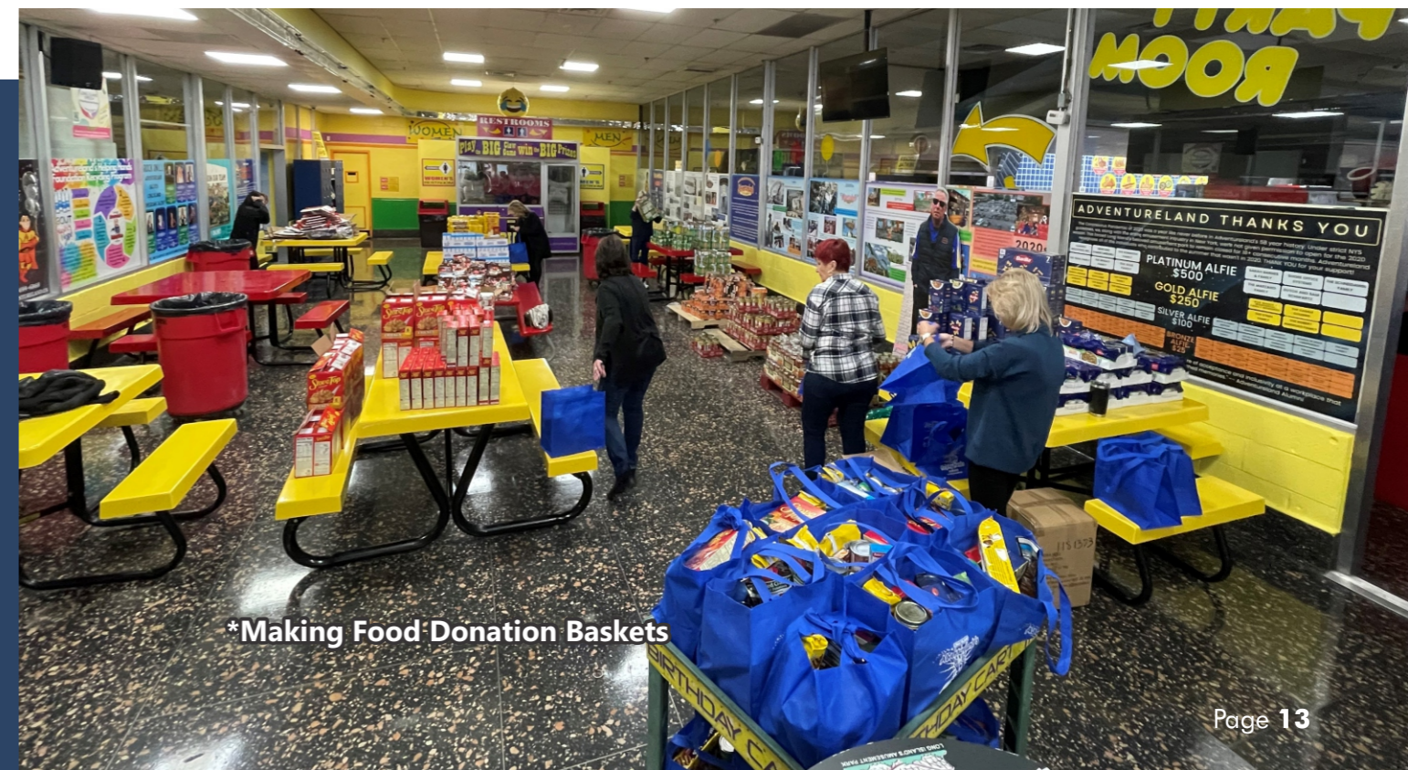
*Making Food Donation Baskets