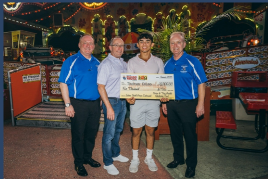
*SACHEM DENTAL GROUP Scholarship recipient

Adventureland's Helping Hands Foundation's Vivian and Tony Gentile SACHEM DENTAL GROUP Endowment Recipient