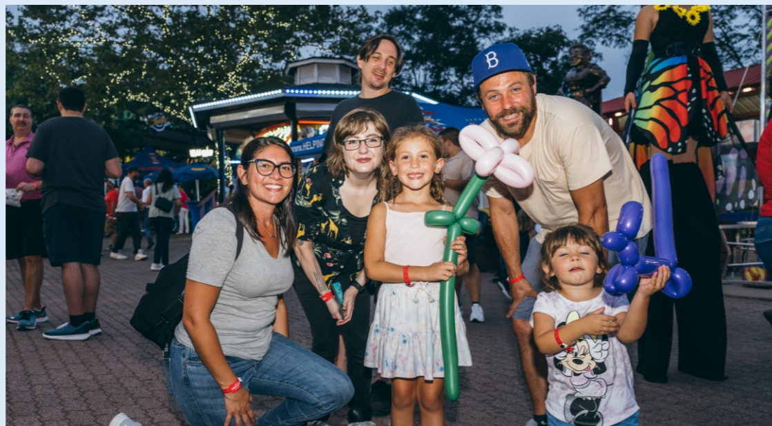
*Family Fun at Adventureland's Helping Hands Foundations VIP Night!