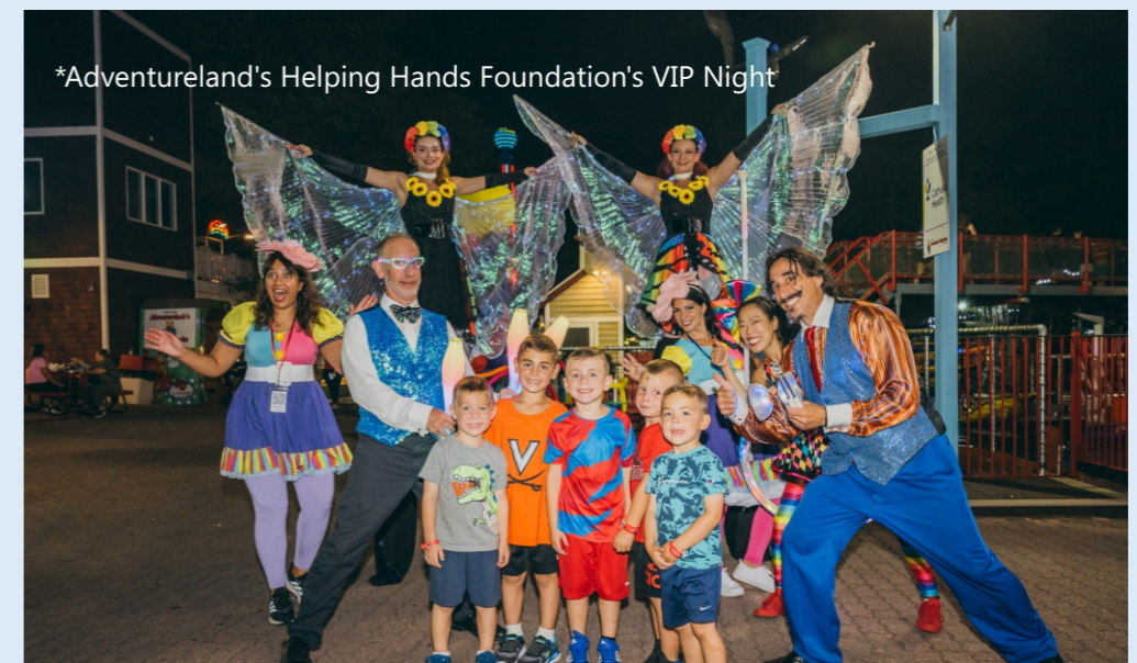
*Adventureland's Helping Hands Foundation's VIP Night