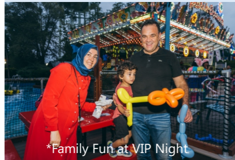
*Family Fun at VIP Night

On Friday, September 8, 2023 Adventureland's Helping Hands Foundation hosted the 6th Annual VIP Night fundraiser at Adventureland.